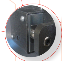
stainless steel retractable boltwork