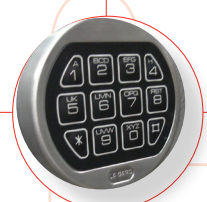
optional electronic lock