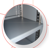
fully adjustable shelving system